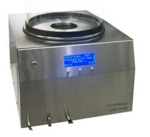
LyoDry Compact benchtop condenser, -55°C OR -85°C