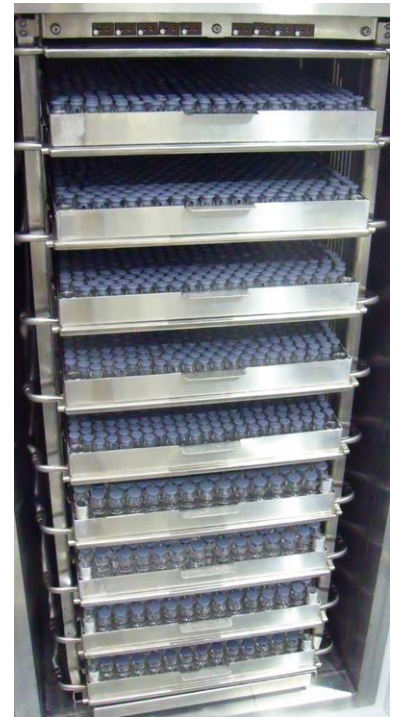
9 x 316L SS product shelves with optional stoppering

CONTACT US FOR A QUOTATION AND/OR FURTHER INFORMATION: enquiries@mechatechsystems.co.uk | +44 (0) 1454 414723