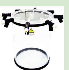
LSDCV 8-Port Acrylic Chamber