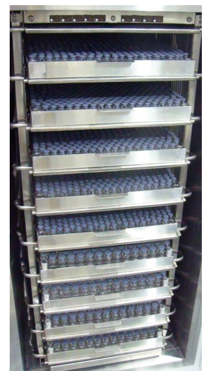
9 x 316L SS product shelves with optional stoppering

CONTACT US FOR A QUOTATION AND/OR FURTHER INFORMATION: enquiries@mechatechsystems.co.uk | +44 (0) 1454 414723