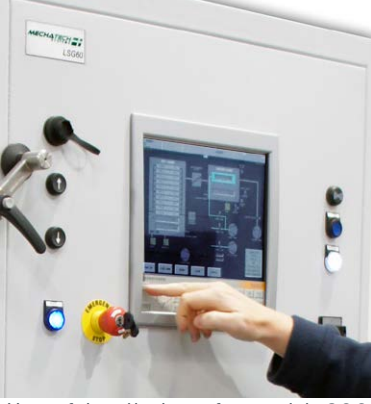
User friendly interface with 200 retrievable process profiles