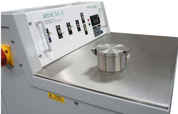
HySCAN II, used in production foundries worldwide, provides analysis within 5 minutes of sampling

The HySCAN II Hydrogen in Aluminium Analyser is used on the shop floors of production foundries throughout the world, providing the quantitative measurement of hydrogen in the melt within 5 minutes of sampling.