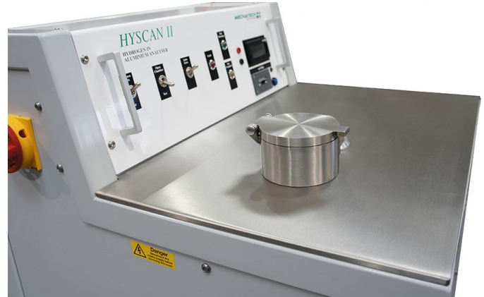
Hyscan II, used in production foundries worldwide, provides analysis within 5 minutes of sampling

Substantial improvements in the quality and reliability of aluminium alloy castings can be achieved if the hydrogen content of the melt is controlled. Aluminium alloys absorb hydrogen in the liquid state and unless it is removed, porosity will occur in the casting. Accordingly, an accurate measurement of hydrogen in the melt before casting is essential to ensure that degassing operations achieve the specified quality acceptance value.