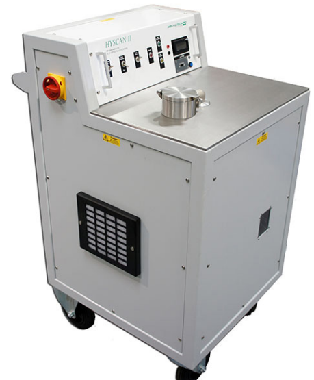
Hyscan II is UK designed, manufactured and supported

Australia, Brazil, Bulgaria, Canada, China, Eire, Finland, France, Germany, Greece, Holland, Hungary, India, Indonesia, Italy, Japan, Korea, New Zealand, Norway, Oman, Romania, Singapore, South Africa, Sweden, Thailand, Turkey, United Kingdom, United States, Venezuela