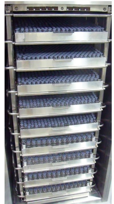
9 x 316L SS product shelves with optional stoppering

CONTACT US FOR A QUOTATION AND/OR FURTHER INFORMATION: enquiries@mechatechsystems.co.uk | +44 (0) 1454 414723