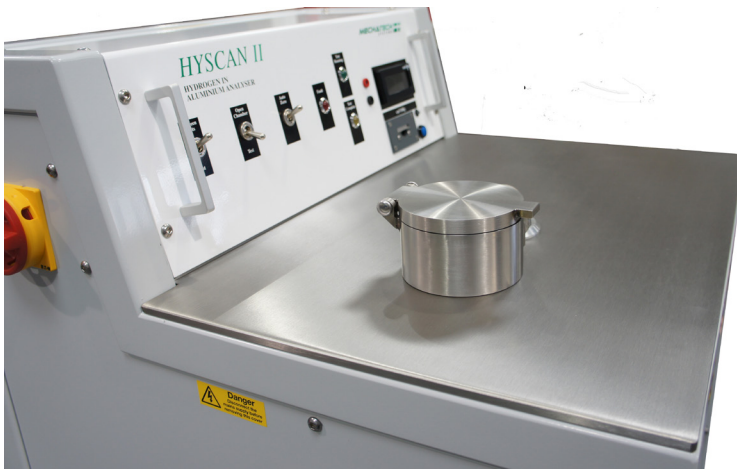
HyScan II, used in production foundries worldwide, provides analysis within 5 minutes of sampling

The HyScan II Hydrogen in Aluminium Analyser is used on the shop floors of production foundries throughout the world, providing the quantitative measurement of hydrogen in the melt within 5 minutes of sampling.