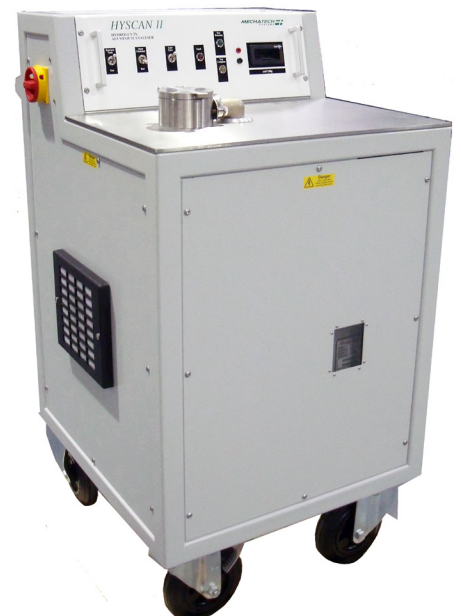
HyScan II is UK designed, manufactured and supported

Australia, Brazil, Bulgaria, Canada, China, Eire, Finland, France, Germany, Greece, Holland, Hungary, India, Indonesia, Italy, Japan, Korea, New Zealand, Norway, Romania, Singapore, South Africa, Sweden, Thailand, Turkey, United Kingdom, United States, Venezuela